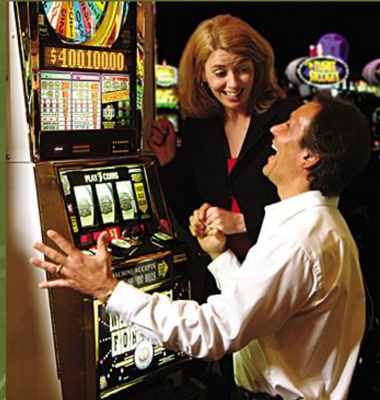
Baal: Prosperity God